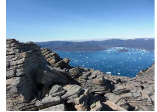
view on the neighbour fiord

Situated along the waterway "route" from South Greenland's airport in Narsarsuaq to the main towns of Narsaq and Qaqortoq, Ipiutaq guest farm 's surroundings offer a large diversity of landscapes , from snow-covered mountain peaks and clear streams with waterfalls to rocky beaches and green pastures.