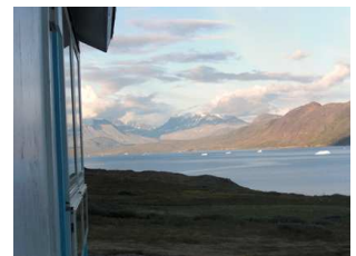
view on the mountain peaks