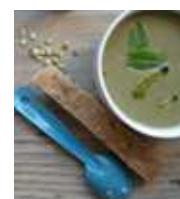
wild sorrel soup