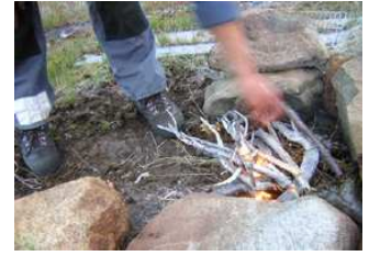
on the warm outside