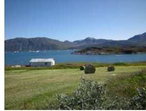
summer at Ipiutaq