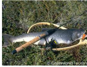
Arctic char just caught