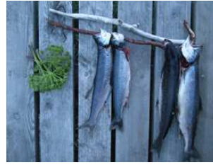
Arctic char waiting for soup