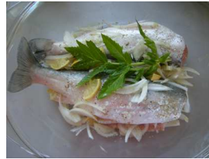
Arctic char for oven