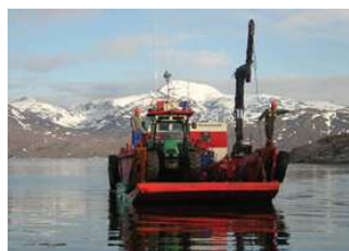
delivery of a tractor