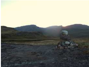
from the farm to the river

The main river is around 3 km and offers an interesting diversity of sections, such as rapid flowing water, deep clear pools or waterfalls and rocky places. From Ipiutaq guest farm, the hike to reach the main part of the river takes around 45 minutes to one hour.