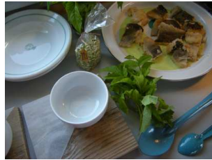
cooking with fish