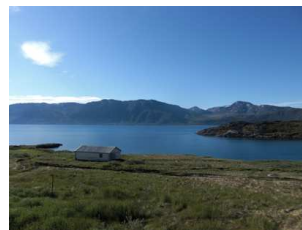
view on the fjord