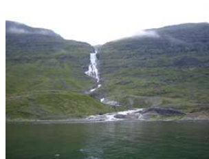
at the end of the lake