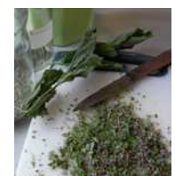
wild dried herbs

The place, opened in 2007, is known for its original French-Greenlandic gourmet cuisine based