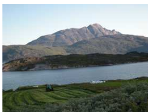
harvest time at Ipiutaq

At Ipiutaq guest farm, you can experience Greenland's wilderness and agriculture , enjoy home cooked meals and sample new food , enjoy outdoor activities , such as, hiking, picking berries or working in the farm, or just relax and take in the scenery in sumptuous and unusual surroundings .