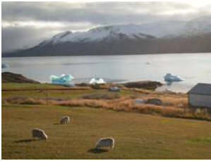
sheep and ices