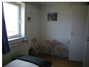
to relax in your room