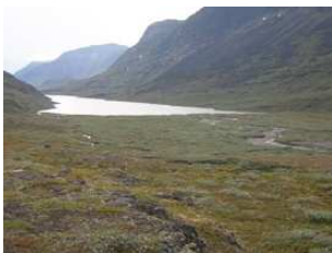
from the river to the lake

The river flows into a 2,5 km long lake connected to the fjord through a 200 m stretch of river where a lot of fish are swimming up to the lake at high-tides. This stretch of the river flows into the “ilua” – which means “inside” in Greenlandic – the protected part of the fjord, and then to the open fjord.