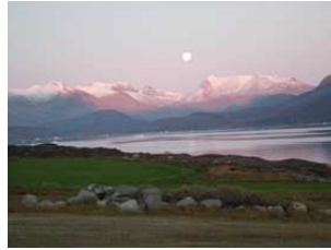
at the ends of the earth