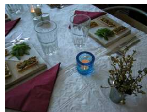
sample new food

"Ipiutaq's rare combination of excellent gastronomy, comfort and wild greenlandic nature is absolutely unique, highly addictive and completely unforgettable..."