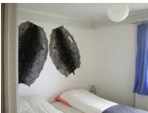
guestroom at home