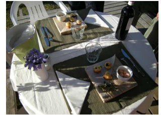
dinner after a fishing day