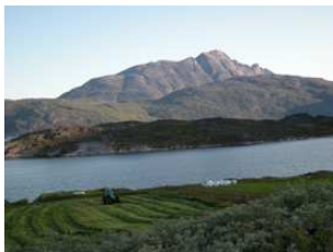
harvest time at Ipiutaq

Situated along the waterway "route" from South Greenland's airport in Narsarsuaq to the main towns of Narsaq and Qaqortoq, Ipiutaq guest farm's surroundings offer a large diversity of landscapes , from snow-covered mountain peaks and clear streams with waterfalls to rocky beaches and green pastures.