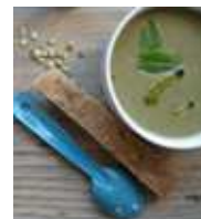
wild sorrel soup