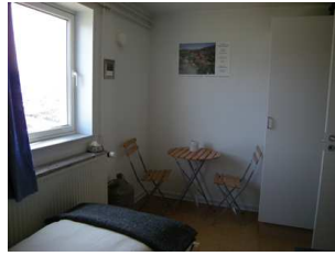
to relax in your room