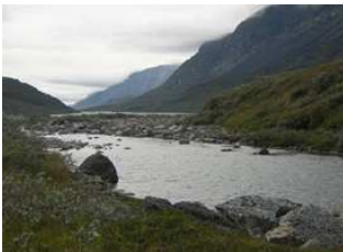
Ilua valley and river