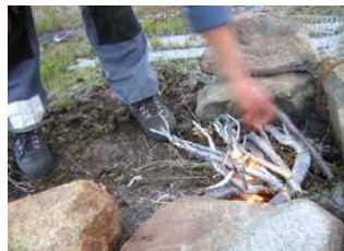
on the warm outside