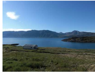
view on the fiord