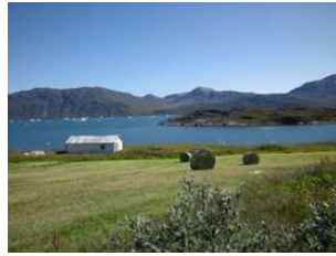
summer at Ipiutaq