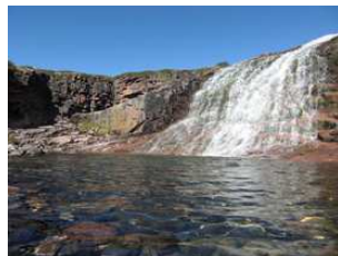
at the foot of a waterfall