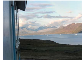
view on the mountain peaks