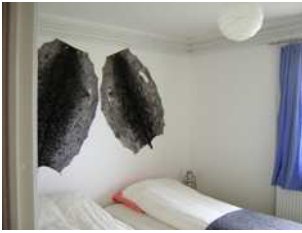
guestroom at home