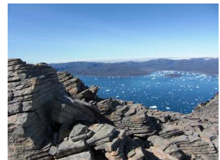
view on the neighbour fiord

At Ipiutaq guest farm, you can experience Greenland's wilderness and agriculture , enjoy home cooked meals and sample new food , enjoy outdoor activities , such as fishing, hiking, camping or working in the farm, or just relax and take in the scenery in sumptuous and unusual surroundings .