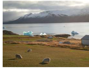
sheep and ices