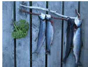
Arctic char waiting for soup