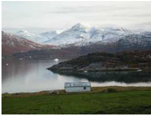
spring at Ipiutaq