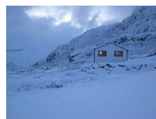
currently under renovation...