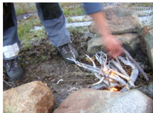
on the warm outside