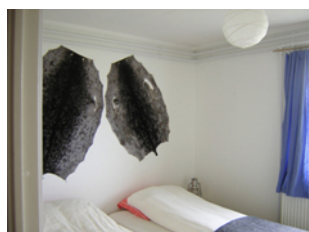
guestroom at home