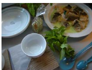
cooking with fis