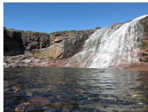
at the foot of a waterfall