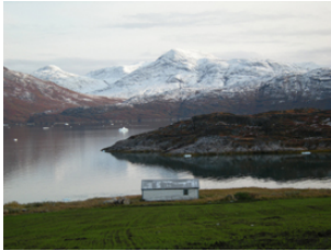
spring at Ipiutaq