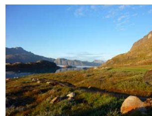
...and the mountains