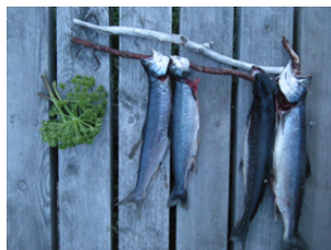
Arctic char waiting for soup