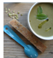
wild sorrel soup