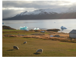
sheep and ices