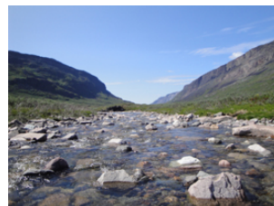
Ilua river in the afternoon

If you like fishing, why not catch some Arctic char in the river Ilua (one hour's hike from the house), one of the best places for fishing in Greenland . Just down our house, you can also catch some Greenland cod or Atlantic cod in the fjord. Agathe will be happy to cook them for her “Greenlandic bouillabaisse” or simply oven-steam them with wild herbs and seaweeds.