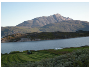
harvest time at Ipiutaq

Situated along the waterway "route" from South Greenland's airport in Narsarsuaq to the main towns of Narsaq and Qaqortoq, Ipiutaq guest farm's surroundings offer a large diversity of landscapes , from snow-covered mountain peaks and clear streams with waterfalls to rocky beaches and green pastures.