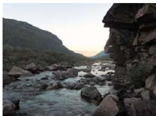
Ilua river in the evening