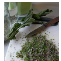
wild dried herbs

The place, opened in 2007, is known for its original French-Greenlandic gourmet cuisine based on local products. After a wonderful walk in the area, you can enjoy a nice dinner in our house . Your starter could be whale skin - called mattak in Greenlandic - served with our angelica-