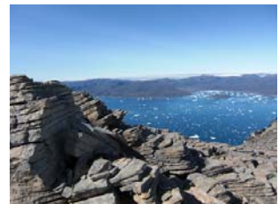
view on the neighbour fiord

At Ipiutaq guest farm, you can experience Greenland's wilderness and agriculture , enjoy home cooked meals and sample new food , enjoy outdoor activities , such as fishing, hiking, camping or working in the farm, or just relax and take in the scenery in sumptuous and unusual surroundings .