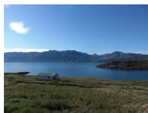
views on the fiord...