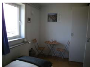
to relax in your room