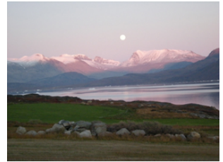
the ends of the earth

Situated along the waterway "route" from South Greenland's airport in Narsarsuaq to the main towns of Narsaq and Qaqortoq, Ipiutaq guest farm's surroundings offer a large diversity of landscapes , from snow-covered mountain peaks and clear streams with waterfalls to rocky beaches and green pastures.