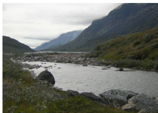
Ilua valley and river