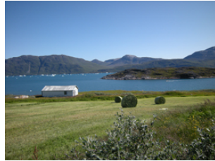
summer at Ipiutaq